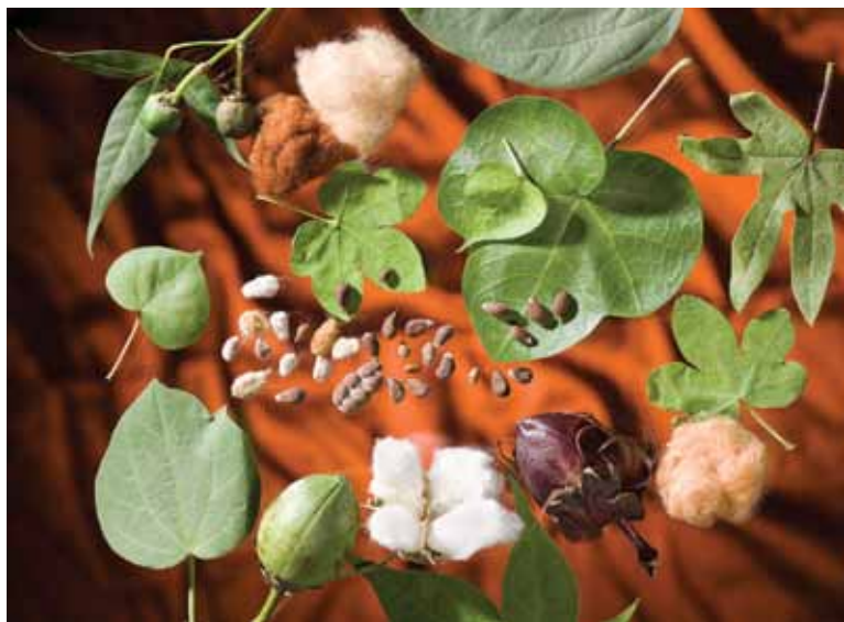
A sample of the range of colors, shapes, sizes, and textures of cotton leaves, bolls, and seeds in the National Cotton Germplasm Collection.