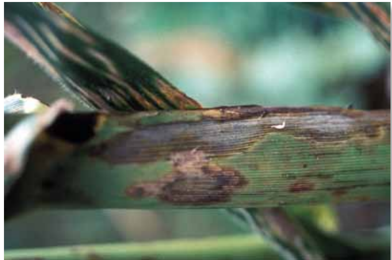
Gray leaf spot of corn.